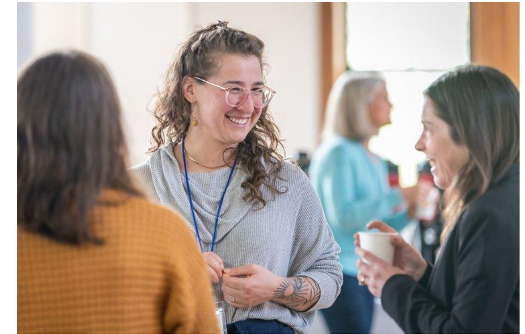
Mass ECAN members networking at this year's conference

This summer, Mass ECAN launched a Peer Learning Pilot Program with 8 members from the network. While meeting monthly for 8 months, the cohort has shared skills, collaboration projects and personal challenges and in so doing has built an intimate professional community.