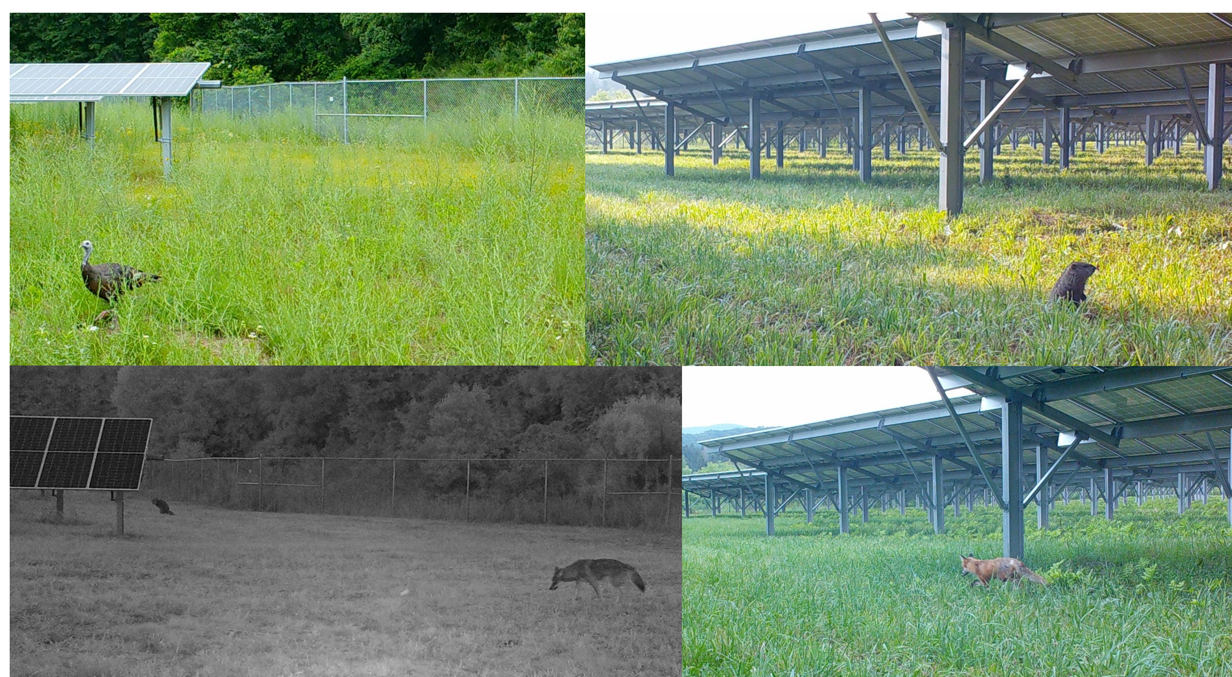
Fig. 1: Wildlife activity observed from Browning trail cameras on motion capture mode at both pollinator-friendly (left) and conventional (right) arrays.