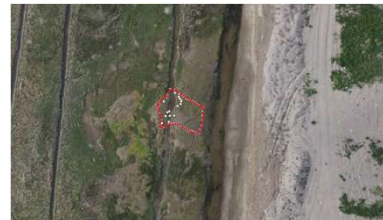
2019 RGB Bare Ground

I found from my data collection and analysis that the classification model accurately classified the bare ground areas I delineated as a bare ground feature. Comparing the model classifications with the RGB images and SWIR, I found that the bare ground area has recovered greatly since 2019. Vegetation such as salicornia and limonium has grown in, covering the area significantly than in 2019. In the SWIR images, I observed inundation of the bare ground area which means that there is less reflectance from vegetation and more light absorption.