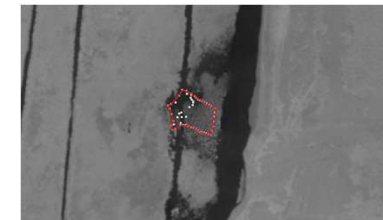
2021 SWIR Bare Ground