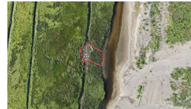
2021 RGB Bare Ground