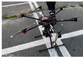
Matrice 600 Drone

Collecting data at Peggotty Beach using Trimble.