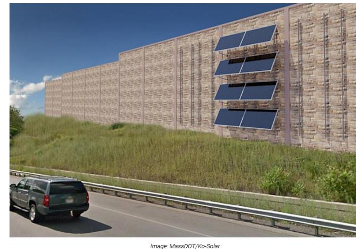
Figure 1: 3D rendering of proposed PVNB along Route 128 in Lexington.

In Massachusetts, solar energy can provide a more sustainable method of energy generation in the urban areas of the future. Noise barriers offer the opportunity to be used in conjunction with solar arrays, referred to as PVNBs (photovoltaic noise barriers). The goals of this project were as follows: create a GIS layer and database detailing each sound barrier in the state and their characteristics (location, surface area, length, height, building material, etc.); identify the potential for these sites to be used as PVNBs, through the National Renewable Energy Laboratory's PVWatts tool, finding energy generation potential for each site and as a whole.