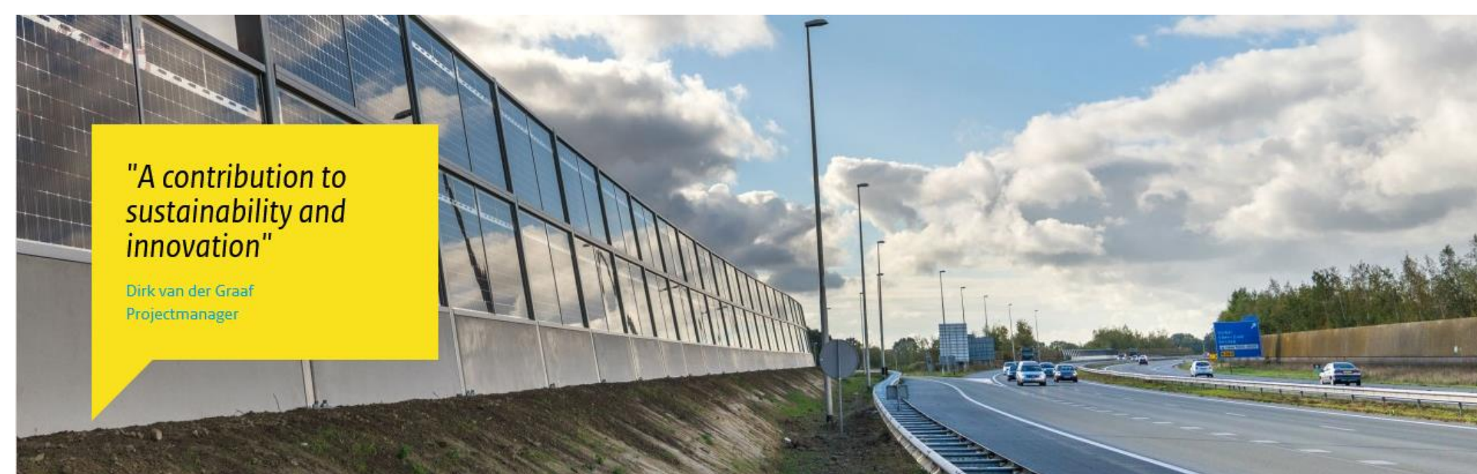
Figure 2: PVNB along the A50 motorway in the Netherlands.