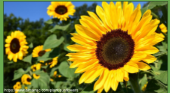
Common sunflower ( Helianthus annuus ) acts as an insectary, and significantly reduces the pathogenesis of Crithidia bombi , a harmful parasite, in bumblebees.