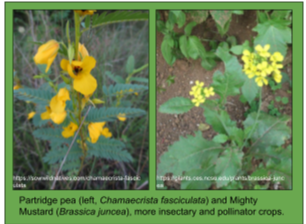
Partridge pea (left, Chamaecrista fasciculata ) and Mighty Mustard ( Brassica juncea ), more insectary and pollinator crops.