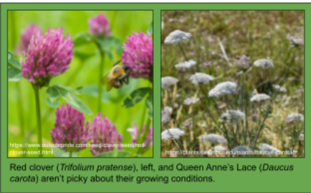
Red clover ( Trifolium pratense ), left, and Queen Anne's Lace ( Daucus carota ) aren't picky about their growing conditions.