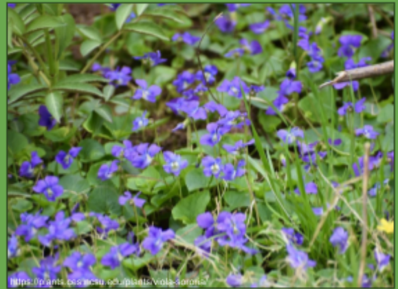
Common blue violet ( Viola sororia ) is a New England native that blooms early and enjoys shade, making it a great low-maintenance ground cover.