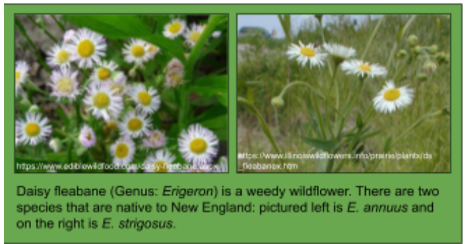
Daisy fleabane (Genus: Erigeron ) is a weedy wildflower. There are two species that are native to New England; pictured left is E. annuus and on the right is E. strigosus .