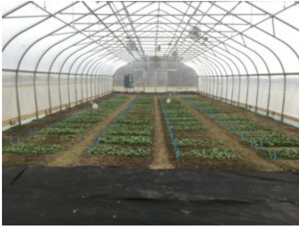
• Spinach high tunnel variety trial at the UMass Research Farm, before the first harvest. December 8, 2020.