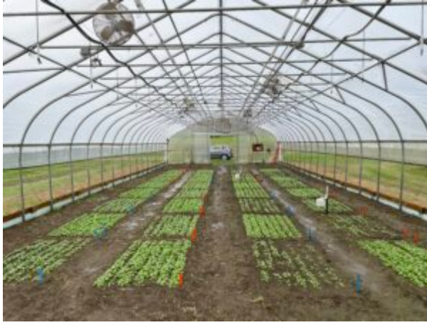
Full spinach germination/stand trial, October 22, 2021. The two left-hand beds received the buckwheat cover crop treatment.

4. Variety trial, winter 2022-23: In fall 2023, a spinach variety trial was set up at the UMass Crop & Livestock Research & Education Farm in South Deerfield, MA. This trial was managed by S. Scheufele of UMass.