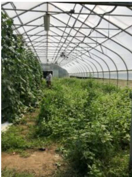
Buckwheat cover crop growing in half of the high tunnel (right), summer 2021. A cucumber trial was underway in the other half of the tunnel (left)