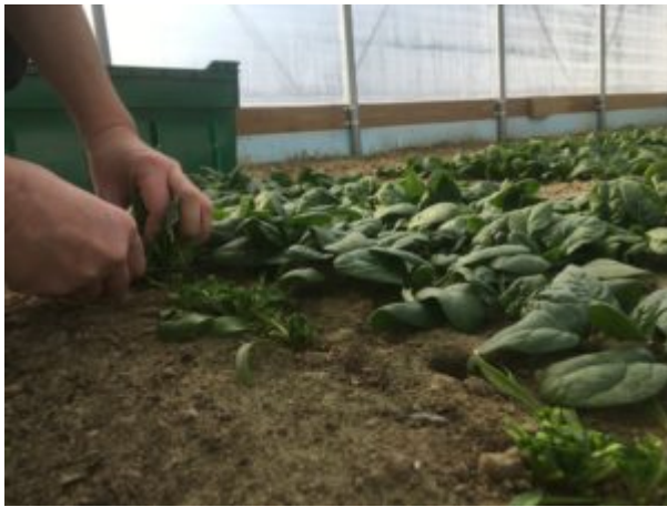
Harvesting spinach from the high tunnel variety trial. December 22, 2020.

2. Variety trial, 2021-22: We did not undertake a full variety trial for winter 2021-22 but instead incorporated the evaluation of 2 spinach varieties into the winter 2021-22 germination/stand trial.