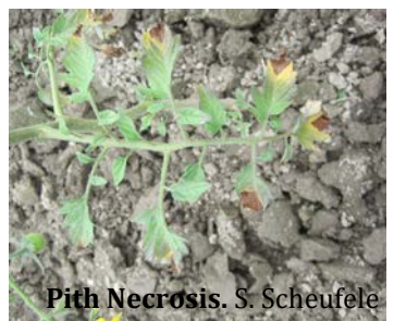
Pith Necrosis.