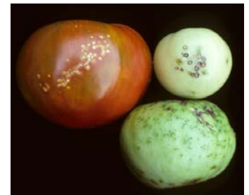
Upper left-Canker, Upper Right-Spot, Lower-Speck.

Tomato Pith Necrosis is caused by Pseudomonas corrugata and other soil-borne species of Pseudomonas . While high tunnels and greenhouses provide ideal conditions for the growth of early season tomatoes, this environment also provides ideal conditions for this emerging disease. Pith necrosis generally occurs on early planted tomatoes growing when night temperatures are cool, the humidity is high, and the plants are growing vigorously because of excessive levels of nitrogen. The disease is also associated with prolonged periods of cloudy, cool weather. Initial symptoms often appear just as the first fruit clusters reach the mature, green stage, and consist of yellowing and wilting of young leaves. Serious infections can result in yellowing and wilting of upper portions of plants, with brown to black lesions on infected stems and petioles. When stems are cut longitudinally, the center of the stem (pith) may be extensively discolored, hollow, and/or degraded. Stems may be swollen, numerous adventitious roots can form, and infected stems may shrink, crack, or collapse. The epidemiology of this disease is not well understood; it is possible that the bacteria are seed-borne and most certainly survive in the soil in association with infected tomato debris.