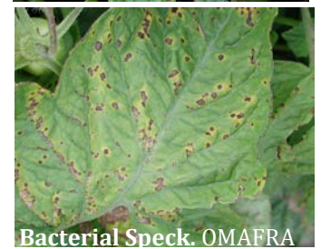
Bacterial Speck. OMAFRA