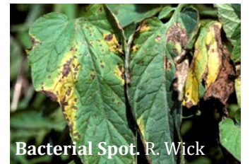
Bacterial Spot. R. Wick