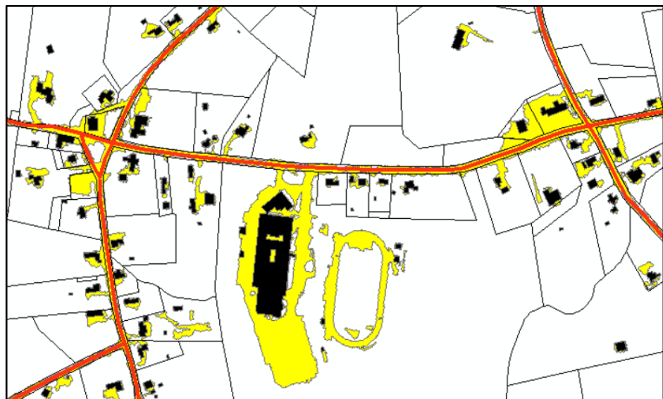
Figure 3. Example parking lot geospatial data showing impervious surfaces in yellow and roads in red. Building roofprints are shown in black. The large building at center is a regional high school with a large paved parking lot to the rear.

Measurement tools (such as the Measure feature in ArcGIS or the Measure Area feature in QGIS) can then be used to outline the parking lot and