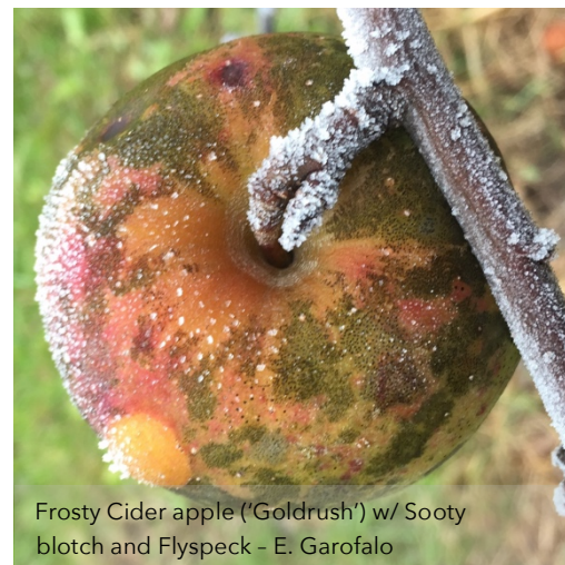
Frosty Cider apple ('Goldrush') w/ Sooty blotch and Flyspeck - E. Garofalo