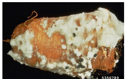
White mold.

White mold ( Sclerotinia sclerotiorum ) affects many vegetable crops but carrots are particularly susceptible, especially late in the season and during storage. The fungus may be present in soil, storage areas, or containers. Symptoms include characteristic white mycelial growth and hard, black sclerotia (masses of fungal tissue that serve as long-term survival structures), which may be seen on the crown of infected carrots. In storage, carrots develop a soft, watery rot, and fluffy, white mycelia and sclerotia can also develop. Sclerotia can persist in soil for many years and the fungus has a very wide host range, making this disease difficult to manage. Grasses and onions are non-hosts that can be used in rotations, and a commercially available biocontrol product, Contans, has been shown to be effective in parasitizing overwintering sclerotia. Contans should be incorporated into infested soils in the fall to give the biocontrol fungus time to infect the sclerotia.