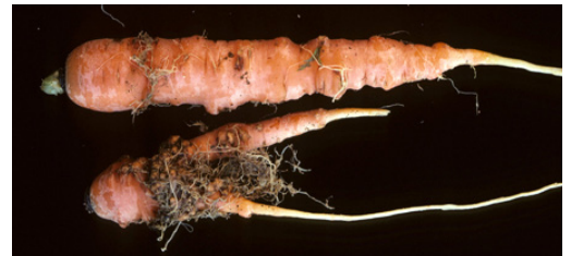
Root knot nematode.

Root knot nematode ( Meloidogyne hapla ) forms galls or root thickenings of various sizes and shapes. Where soil populations of M. hapla are high, symptoms include stunted plants, uneven stands, premature leaf death, and forking and swelling of both lateral and tap roots, which can significantly reduce marketable yield. M. hapla persists in the soil and has a very wide host range so rotation can be difficult, but grasses are non-hosts so small grains, corn, and grassy cover crops like Sudangrass can be grown in rotations to reduce the size of the population.