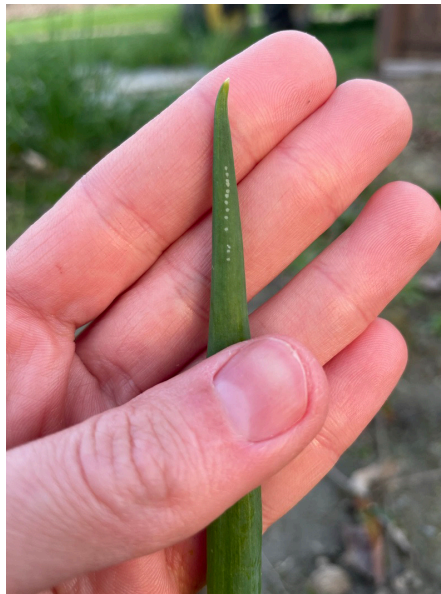
Allium leafminer feeding/oviposition marks in scallion.

Lifecycle: Though we still do not have accurate phenology models to allow us to predict the emergence of the fall flight, fall ALM adult activity has begun in early- to-mid-September the past five years (September 19, 2017, September 11, 2018, September 9, 2019, September 8, 2020, and September 3, 2021), so we anticipate a similar emergence time this year. Adults are active for approximately 7 weeks, or through the end of October. Emerged adults create the diagnostic line of oviposition puncture marks on allium leaves during feeding and egg-laying. Larvae that hatch from eggs eat their way down the inside of the leaves toward the bulbs opening up physical wounds where soft rot pathogens often enter. The larvae then pupate either inside the bulb and stem or in the soil around the plants for the winter and early spring. The spring generation typically emerges in mid-April and is active for about 5-6 weeks.