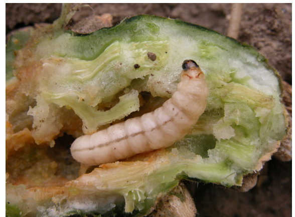
Squash vine borer larva.