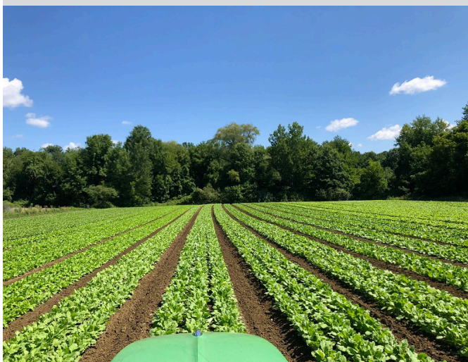
Fall brassica root crops are sizing up, in fields like this one of radishes and turnips in Hampshire County.