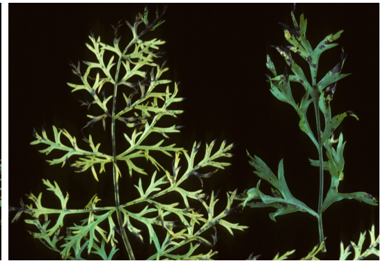
Alternaria leaf blight (left) and bacterial leaf blight (right).

Lesions on petioles are also common and can quickly kill entire leaves. A. radicina can also produce a dry, mealy, black decay on known as black rot on carrot roots held in storage.