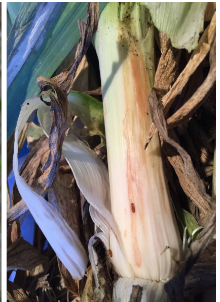
Allium leafminer pupa in leek. Note the soft rot in the larval mines.

Damage: Since there are typically fewer cultivated and wild alliums in the environment in the fall, growers in Pennsylvania and New York have experienced a “concentration effect” with their fall-grown alliums. Leeks that were not treated with insecticides averaged over 40 maggots and pupae per plant, with a high of 160, in research trials conducted by Teresa Rusinek and Ethan Grundberg of Cornell Cooperative Extension in the fall of 2020. Much smaller populations of allium leafminer can still be problematic, causing cosmetic damage to scallion foliage and opening physical wounds in leeks where soft rot bacteria can ruin the crop.