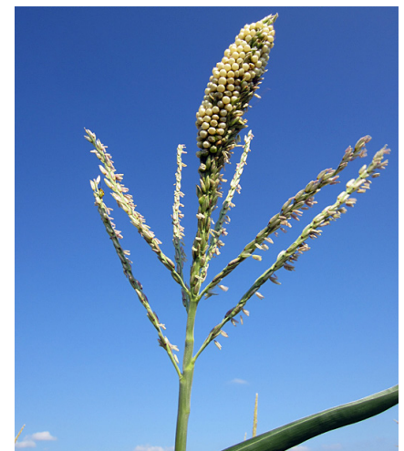
Tassel-ear on a tiller of corn.

Levels of corn caterpillar pests remain similar to last week—low European corn borer and fall armyworm trap captures, with some reports of FAW damage in pre-tasseling corn, and corn earworm numbers putting most growers on 4-day spray schedules. Some farms are nearing the end of their sweet corn season and may have made their last corn earworm spray already. For corn that will be harvested in September and October: if maximum daytime temperatures drop to 80°F and below for a few days in a row, caterpillar development will slow, and cooler nighttime temperatures will limit moth activity, so spray intervals may be extended for 1-2 days. ECB will overwinter in infested corn stalks, so chop residues promptly after harvest is complete to reduce this overwintering population as we move into fall.