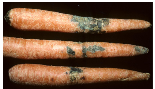
Black root rot.

Black root rot ( Thielaviopsis basicola ) occurs primarily in storage when conditions are not ideal and temperature and humidity are too high. The fungus causes superficial, irregular, black lesions on roots. The discoloration, caused by masses of dark brown to black chlamydo spores, is limited to the skin. The pathogen rapidly invades wounded tissue and is favored by long post-harvest periods without cooling, so careful harvest and immediate cooling (< 41°F) can minimize the impact of this disease.