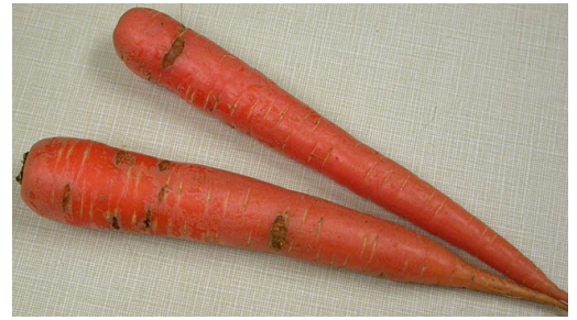
Cavity spot.

Pythium species can occur during early root development and are favored by moist soil conditions. Root dieback symptoms appear as rusty-brown lateral root formation, or forking and stunting; symptoms that can be easily confused with damage from nematodes, soil compaction or soil drainage problems. Cavity spot often shows up later in the season, closer to harvest. Horizontal, sunken lesions varying in size from 1-10 mm appear on the surface of the root and can provide an ingress for secondary fungal or bacterial infections.