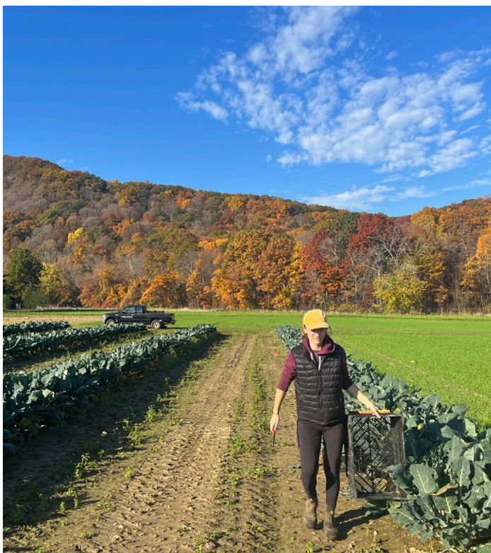
Harvesting our broccoli fungicide trial looking at reducing spray volumes for control of Alternaria - stay tuned for results!

Damping off is developing now in high tunnel spinach. Damping off is caused by several soil-borne fungal and oomycete pathogens that are ubiquitous in all soils but generally only cause disease in young, weakened, or slow-growing plants, or when soil is too wet. Damping off pathogens cause seedlings to rot, both before and after emerging from the soil. Damping off can occur in the field but is especially common in winter high tunnels, when temperatures are cooler and plants are growing slowly. When tunnels