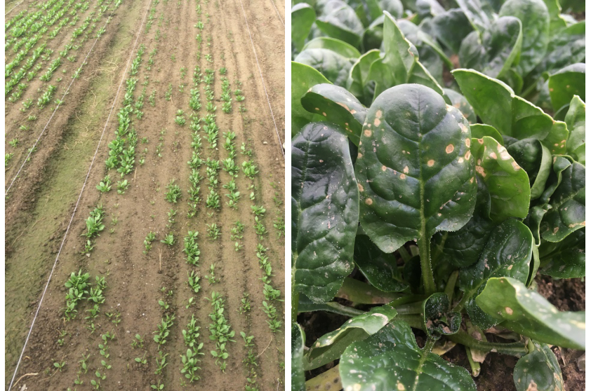
Left: Poor stand in high tunnel spinach, caused by damping off.

are used continuously, without rest, damping off organisms proliferate while numbers of beneficial microbes decrease. Making time for cover cropping or incorporating green residues before planting is the best way to support beneficial microbes in soil to help them outcompete the pathogens. Other methods for controlling damping off could include using fungicide-treated seeds or fungicides applied to soil. Some other methods being trialed around the region include soil steaming, solarization, and anaerobic soil disinfection. All of these are labor-intensive and costly, but can be effective at suppressing disease, weeds, and insects. For more information on damping off, see the article in the April 9, 2020 issue of Veg Notes .