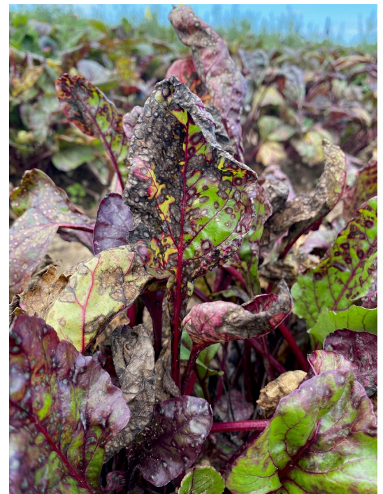
Symptoms of Cercospora leaf spot on table beet cv. Ruby Queen.

Fungicides are often applied to reduce the spread of CLS and potential crop loss. The most used conventional products are Tilt (propiconazole, Fungicide Resistance Action Committee [FRAC] group 3) and Miravis Prime (pydiflumetofen + fludioxonil, FRAC 7 + 12). However, the development of fungicide resistance is one of the major concerns for the sustainability of disease control. Organic Materials Review Institute (OMRI)-listed products with moderate efficacy for CLS control according to our previous studies include: LifeGard ( Bacillus mycoides isolate J; FRAC P 06) and Cueva (copper octanoate, FRAC M 01) + Double Nickel LC ( Bacillus amyloliquefaciens strain D747; FRAC BM 02). Apart from being registered for use in organic table beet production, these products also have a place in conventional production for rotation of different FRAC groups and fungicide resistance management. The objective of this study was to evaluate the efficacy of selected fungicides and fungicide programs for CLS management in table beet, including some additional OMRI-listed products.