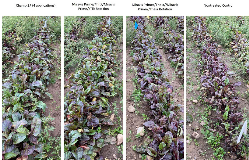
Comparisons of table beet foliar health in plots of four selected treatments within a small plot replicated trial conducted at Geneva, New York.

Results. Conditions were conducive for CLS which resulted in high severity in nontreated plots (90.1%) by the end of the season (109 DAP). All treatments significantly reduced CLS severity compared to the nontreated plots. The most efficacious treatments were Champ 2F and the rotation programs that included Miravis Prime. Substituting Tilt with Howler or Theia in the Miravis Prime rotation program had no significant effect on CLS control and were all highly effective. As single products, Theia and Howler provided moderate and equivalent CLS control, reducing final severity by 41.3% and 41.6%, respectively. The experimental product, BF009-03 also provided moderate CLS control, and interestingly, CLS severity was significantly higher in plots treated with the higher (0.75 lb/A) rate than those receiving 0.5 lb/A ( Figure 2; Table 2 ).