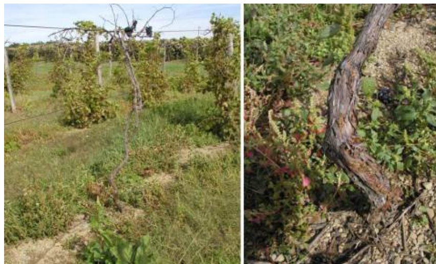
Figure 4 and 5: Collapsed vine of French hybrid ‘Chambourcin’ (left) following winter cold damage to the trunk and onset of crown gall at the base of the trunk (right). The entire vineyard eventually collapsed, but was completely restored with new trunks from shoots (suckers) emanating from below galls.

Growers of the hardier French hybrids generally suffer fewer economic down times from winter cold-induced crown gall than growers of V. vinifera . We cannot escape bouts of brutally cold winter weather, but we can (and should) plan for the worst and try to wisely match variety with site in order to minimize or eliminate losses to winter trunk damage and crown gall. Simply put, cultivars of V. vinifera and cold-sensitive hybrids should be planted only on the best sites in Pennsylvania—sites that ensure good cold air drainage during the worst bouts of winter weather. Where a vineyard is already established, vine management that maximizes vine cold hardiness (balanced timely nutrition, effective disease control, proper balance between growth and yield, good weed and water management) is absolutely essential for minimizing trunk damage and the onset of crown gall after a severe winter cold event.