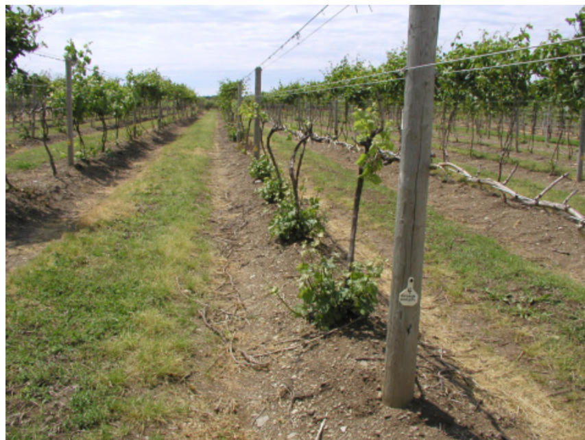
Figure 3: Picture from the NE1020 grape variety trial at North East in Erie county PA. Note the six-year-old Gruner veltliner/101-14 vines (foreground) that were laid low by the 2014 Polar Vortex. Although existing canopies are dead or nearly dead, a flush of sucker growth from the scion (protected by hilling during the previous fall) provides the means for trunk renewal. Also note the full canopies of cold hardy French hybrids within the same block. While ALL cultivars of V. vinifera were killed back to the ground, all hybrids went on to produce partial to full crops in that year.

All of us would love to be able to train up one original trunk and rely on that single trunk for every vine, every year. Unfortunately for many in the Northeast, that's a pipe dream. Now that you know about crown gall in your vineyard, you can assume that more vines are contaminated than you previously thought. For example, we have a Chambourcin vineyard at the North East lab in which just about every vine is host to the crown gall bacterium. I had no idea this was the case until the winter of 2003-2004, when brutal cold caused nearly every vine trunk to explode with crown gall the following spring (Figures 4 and 5). Apparently, nearly every vine was contaminated with the bacterium and the vineyard collapsed! After discussing my conundrum with Dr. Tom Burr at Cornell University, an expert in crown gall biology/pathology, we spent the 2004 season training up new trunks for every vine, using only shoots that originated from below the galls . From 2005 on, the vineyard was enormously productive for almost ten years. Then came the polar vortex of January 2014, followed by the severe winter cold of February 2015, and with it more devastating bouts with crown gall.