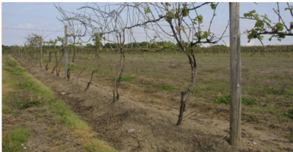
Figure 1: Riesling vines in early June of 2015. In anticipation of severe bud damage, this row of vines was minimally pruned until it was clear what percentage of buds would emerge.

the bacterium generally doesn't cause gall formation on trunks until some injury occurs, usually from severe winter cold damage near the soil line or just above grafts on grafted vines (if you hilled over the grafts last fall). Another search at