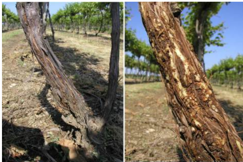
Figures 1 and 2: Crown gall on a trunk of French hybrid ‘Chancellor’ before and after bark is stripped away. Galls appear in spring as white callous tissue, most often at the base of the trunk, gradually turning green/brown and finally dying to turn into dark brown/black corky tissue.

The crown gall bacterium shifts from benign coexistence, as an endophyte inside vines, into a tumor-inducing organism when there is damage or injury to grapevine vascular tissue. When injury occurs to the cambium, the bacterium attaches to plant cells at the wound site and literally inserts a copy of a self-replicating DNA strand (called a plasmid) into the plant cells (infection). The plasmid contains genes that code for hormone production that leads to the growth of tumors. These genetically modified grapevine cambium cells begin to grow tumor tissues with poorly organized vascular structure (that is, not capable of adequately conducting resources needed by the vine) at the wound site instead of organized vascular tissues. The injured trunk areas are never properly repaired by functional vascular tissue and as the tumor tissues grow, the trunk becomes more and more non-functional and eventually the vine collapses. And what is the most common cause of widespread grapevine trunk damage in the Northeast? Severe winter cold—which does not occur in most parts of California and similar warm, wine grape production climates.