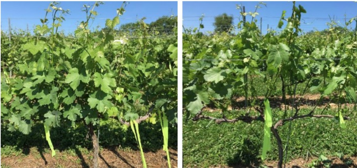
Figure 1. ELR on V. vinifera cv. Grüner Veltliner at trace-bloom June 7, 2016, Fero Vineyards, Lewisburg, PA. Undefoliated vine (left), defoliated vine (right).

ELR is the removal of basal leaves of the main shoots and, optionally, lateral shoots developed from the basal nodes ( http://gph.is/2r3ZLc0 ; Figure 1).