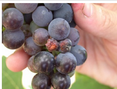
Grape Berry Moth injury

prematurely, split open and shrivel. Webbing produced by larvae prevents the berries from dropping. Feeding by GBM larvae not only reduces yield and contaminates the crop, but their feeding creates infection sites for fruit rots and feeding by fruit flies. At harvest, severely infested clusters may contain several larvae. Wine made from this fruit may be poor quality.