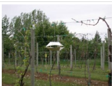
Grape Berry Moth pheromone trap

Sticky traps with a pheromone lure can be used to monitor GBM emergence. Traps should be placed in the vineyard in the early spring, prior to bloom (see picture, left). A minimum of 3 traps/10 acre vineyard block should be used. Traps should be hung from the top wire of the trellis, and placed around the perimeter of the vineyard. Check the traps twice a week for the presence of GBM and record the date of the first moth capture.