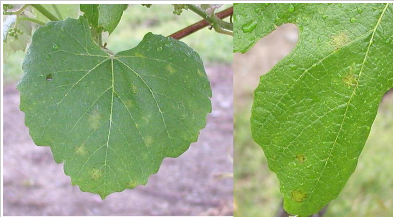
Figure 4. Yellow oil-spot symptoms of downy mildew on young spring leaves.

One more time for emphasis: the immediate pre bloom and first post bloom (7-14 days later) fungicide applications are the most important you'll make all year , regardless of variety grown and disease pressure. These two sprays protect your fruit from all the major fungal diseases (Phomopsis, black rot, downy and powdery mildew). Make sure sprayers are properly calibrated and adjusted for best coverage on a bloom-period canopy, spray every row at full rates and shortest intervals, and NEVER extend the interval between these sprays beyond 14 days.