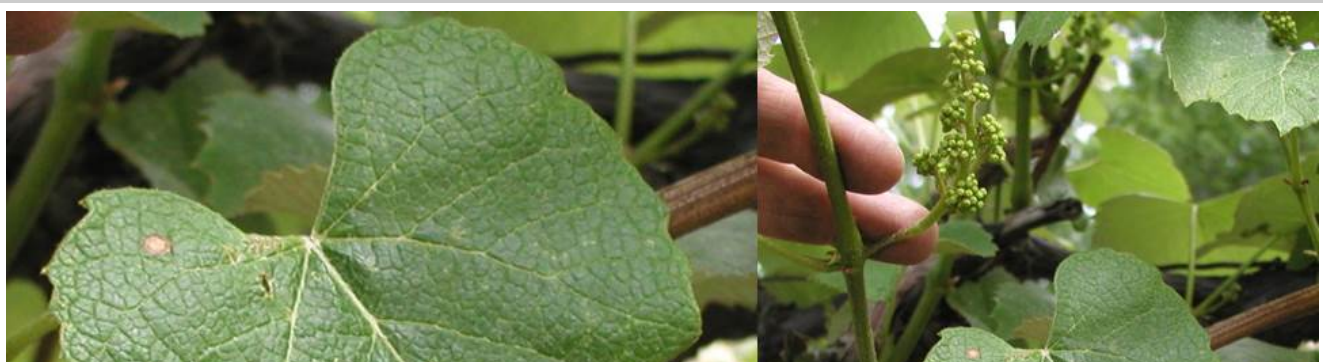
Figure 3. Early (pre-bloom) black rot leaf infections in the cluster zone provide inoculum that can add to problems with controlling fruit infection after capfall. The two small tan lesions on the leaf at node 2 are just inches from the developing inflorescence found at node 3 (picture on the right). These lesions will release spores during rainfall periods that could easily be splashed to highly susceptible cluster stems pre-bloom, and developing fruit after capfall. Resulting fruit infections will lead to crop loss.

An application of mancozeb, ziram, or captan for Phomopsis will also provide control of early black rot infections. The sterol inhibitor fungicides and strobilurins are also good materials for black rot that are more rainfast than mancozeb, ziram, and captan. The sterol inhibitors also provide excellent post infection activity that can be very useful at terminating an infection that has already occurred (but not yet manifested itself).