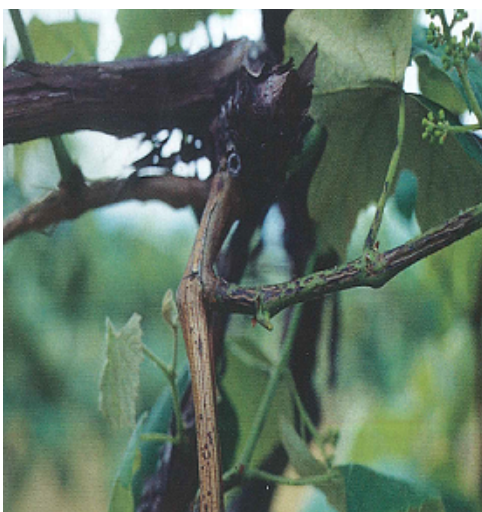
Black, elongated lesions caused by Phomopsis on the basal internodes and leaf petioles of Concord. A dead pruning stub (likely the inoculum source) is directly above.

A combination of sanitation and fungicides is the solution to Phomopsis. Due to the relatively unique disease cycle that involves only one fungal generation per year, sanitation plays a critical role in management. By reducing the amount of infected wood in the vineyard, you can directly reduce the amount of inoculum for the current year, and subsequently, the amount of possible infection next year. As much old and dead wood should be cut off as possible, and burned or mulched and tilled into the row middles. Certain cultural practices, such as cordon-spur pruning, mechanical pruning, and pendulant training systems (e.g high cordon) can favor Phomopsis infection due to the abundance of inoculum that is maintained in the canopy. Phomopsis spores splash-dispersed by rain, so a single infected spur (especially in a pendulant canopy) can be a well-positioned source of inoculum for spreading disease into the fruiting zone.