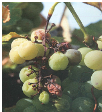
Phomopsis infection on Niagara, girdling the rachis and resulting in loss of the cluster.

Phomopsis cane and leaf spot, Phomopsis viticola , is a fungal disease found in grape growing regions worldwide. The disease is especially prevalent in regions with frequent precipitation during the growing season, such as New York State. Up to 30% yield losses have been observed in vineyards with high inoculum levels in years with wet springs. Losses result from rachis (grape stem) infections that travel into the berries, and from the failed development of cluster wings. Although berry infections occur during the bloom period, the effects on the berries are not visually apparent until after veraison (color change) in August. Berries become necrotic and fall off of the rachises when they're touched.