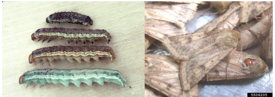
CEW larvae and adults.

Fall armyworm (FAW) is also blown northward on storms, usually arriving in the Northeast in mid-July. Eggs are laid preferentially in whorl-stage corn, and caterpillars create large, ragged holes in the leaves and drop big clumps of frass.