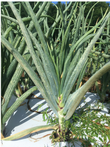
Silvery damage from thrips feeding in onion.

The feeding also allows bacteria to enter the leaves, which can lead to bacterial bulb rots later on, where one or more layers of the onion becomes watery and rotten. The most effective material for organic growers is spinosad (e.g. Entrust). Apply with insecticidal soap (e.g. M-Pede, at the 1.5% v:v rate) to increase efficacy. Entrust can only be used two times in a row before rotating to a different insecticide class. Neem oil (e.g. Trilogy) and azadirachtin (e.g. Azatin O) may be effective also if applied when populations are still low. Pyrethrin (e.g. Pyganic) can provide knockdown control. Labeled conventional materials include neonicotinoids (e.g. Assail, Admire Pro), pyrethroids (e.g. Delta Gold, Declare, Warrior, Pounce, Mustang), spinetoram (e.g. Radiant), and spirotetramat (e.g. Movento). Movento and the neonicotinoids are systemic or translaminar and will work by ingestion; pyrethroids work on contact and will not have long residuals. Use an adjuvant with all materials to help materials adhere to waxy allium leaves, unless it says otherwise on the label.