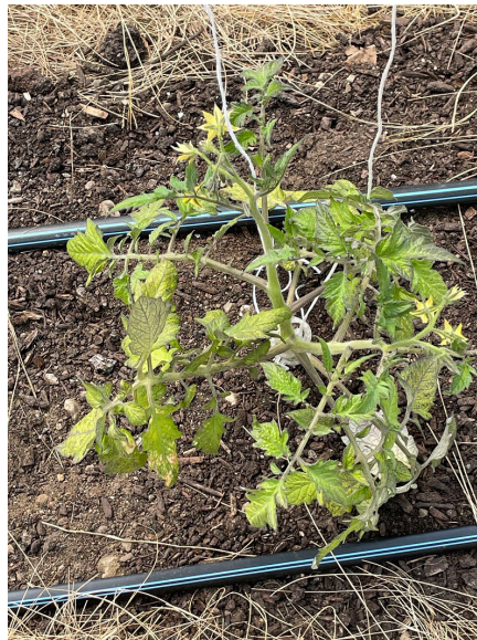
High tunnel tomato infected with lesion nematode. Symptoms resembled those of nutrient deficiency.

Lesion nematodes were found causing damage in high tunnel tomatoes in Franklin Co. this week. The tomatoes were stunted and yellowing and had symptoms that resembled nutrient efficiency. Tomatoes grafted onto Maxi-fort root stock were full-sized and lush green—Maxifort is marketed as being resistant to nematodes. If you notice similar symptoms in your tunnel tomatoes and can rule out other causes like nutrient deficiency, consider submitting a sample to the UMass Plant Diagnostic Lab .