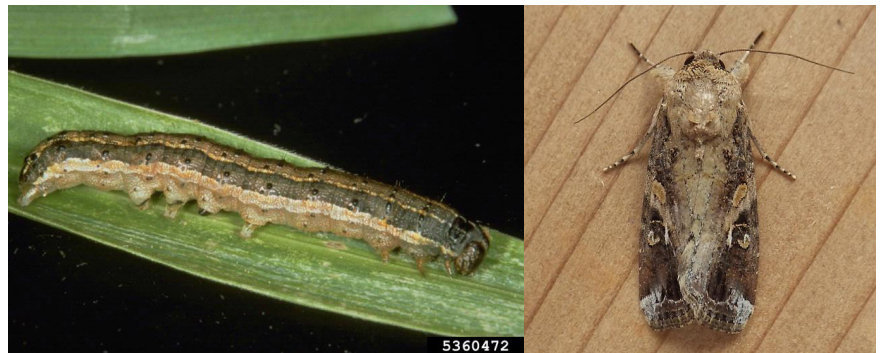
FAW larva and adult.

Pheromones are chemicals produced by organisms to communicate with one another. Pheromones from one species can usually only be detected by that species. There are many different types of pheromones that insects use, but the most common type is the sex pheromone. Usually, females will emit a tiny amount of a chemical that attracts the male and increases the likelihood of mating. These sex pheromones are volatile, meaning they easily evaporate into gaseous form at daytime summer air temperatures, so they are carried on air currents and intercepted by receptors on the males' antennae. The males then flies upwind to find the source of the pheromone, a prospective mate.