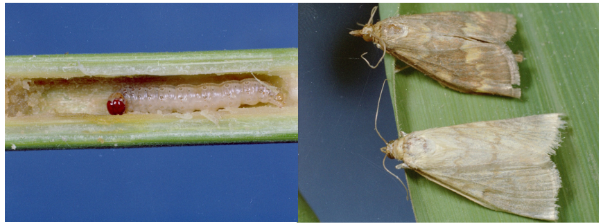
ECB larva and adults.

Corn earworm (CEW) has not historically overwintered in the Northeast, but there are now small overwintering populations that have been detected in parts of NY. None of our trapping sites in MA have detected overwintering populations. Most CEW blow in on storms coming from the South or from overwintered populations in western NY, arriving in mid-July. Eggs are laid in fresh silks and caterpillars enter the ear through the silk channel. There are two generations of CEW per year.