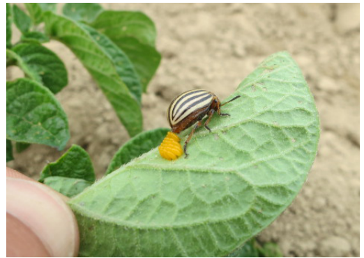
Colorado potato beetle laying eggs.

Lesion nematodes were found causing damage in high tunnel tomatoes in Franklin Co. this week. The tomatoes were stunted and yellowing and had symptoms that resembled nutrient efficiency. Tomatoes grafted onto Maxi-fort root stock were full-sized and lush green—Maxifort is marketed as being resistant to nematodes. If you notice similar symptoms in your tunnel tomatoes and can rule out other causes like nutrient deficiency, consider submitting a sample to the UMass Plant Diagnostic Lab .