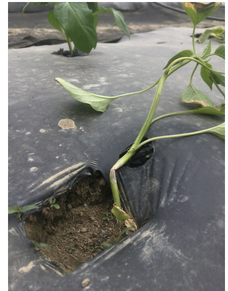
Pepper stem scalded by contact with hot black plastic.

Scalded stems have been reported in plasticulture peppers and tomatoes in the last week – a result of the hot weather we had on June 1 and 2. Black plastic becomes very hot in the sun and can burn stems if it comes into contact