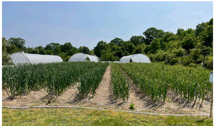
Garlic planted from new seed stock on the left, compared to 8-year old seed stock on the right.

Garlic yellowing is a new normal, often caused by a suite of potyvirus and/or bulb mites which infest the plant and are carried over to the next year with the seed. Periodically buying new seed stock from a reputable supplier can help (see photo above). There are currently no research-proven controls for bulb mites.