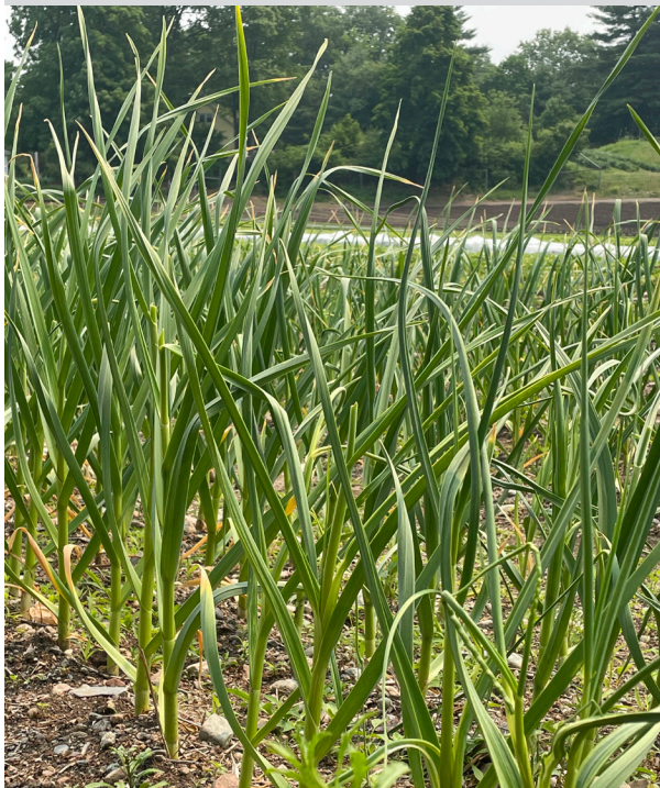
Garlic scapes have been harvested and the crop is looking great at this farm in Norfolk Co. this week.

from seed, meaning the thrips have moved into the crop from the surrounding environment. Transplants purchased from warmer parts of the country can also bring thrips with them and result in high populations early in the season. Thrips feed on allium foliage with rasping mouthparts, resulting in silvery damage that can make crops unmarketable.