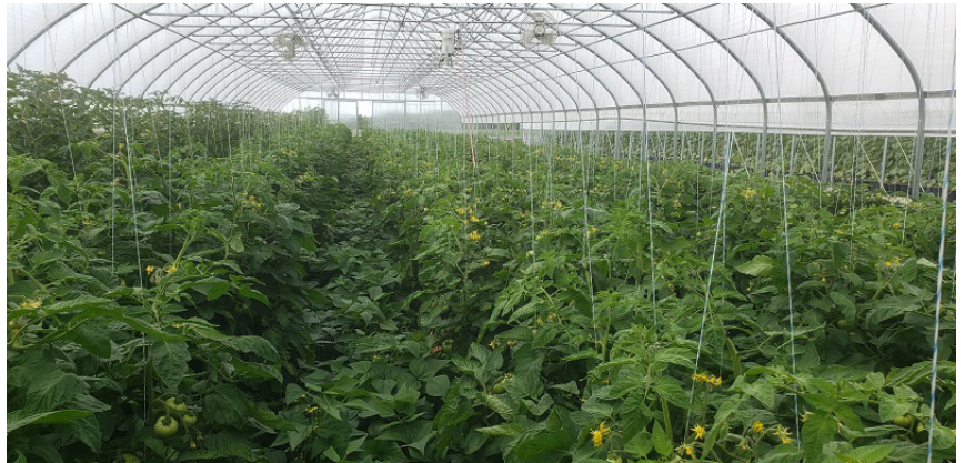
Excess nitrogen can keep plants in a vegetative stage and delay maturity.

How much nitrogen should be applied pre-plant? We recommend no more than 50% of the total nitrogen budget, in this case 75 lbs/ac. This is to prevent excess levels at the wrong stage of crop growth. If too much nitrogen is mineralized too quickly, the crop can become excessively vegetative, delaying maturity and reducing yield. The excess foliage promoted can also become breeding grounds for foliar diseases such as Botrytis gray mold.