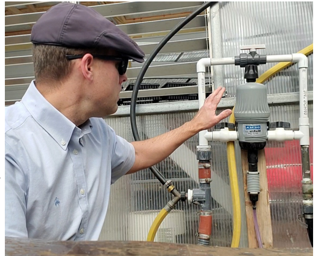
Either a ppm or lbs/ac approach requires a proportional injector.

So, now that we know how to use these two approaches, which makes the most sense for high tunnels? I suggest that both have a role. Parts per million is particularly valuable early in the season, and the precision approach can be important when looking at nutrients besides nitrogen, which can easily be applied at toxic levels. The lbs/ac approach is useful in mid-season when both nitrogen and water demand is high. By understanding both approaches we can back-calculate how many lbs/ac N we are applying in a ppm approach and vice versa. This quick math can reduce over applications and compare our progress at meeting a total nitrogen budget for the crop year. Finally, foliar samples reveal sufficient (or excess) nitrogen levels in the living crop. Now that we understand calculating daily and weekly application rates, we can fine tune adjustments based on the foliar results.