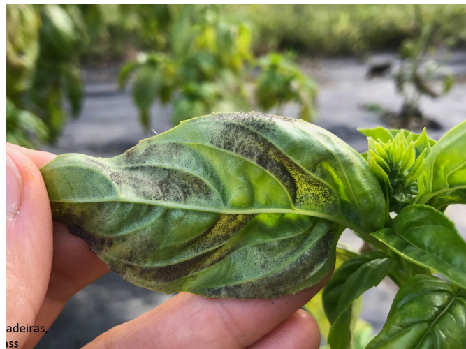
Above: Leaf yellowing between the veins, caused by basil downy mildew infection.