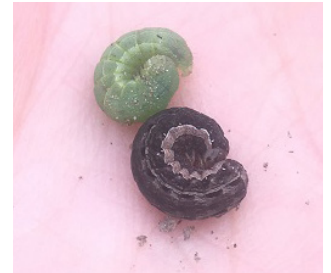
Winter cutworms.

Winter cutworms are continuing to cause feeding damage in tunnels of winter greens. Small larvae feed on leaves and larger larvae feed on roots and petioles, cutting seedlings off near the soil line. Larvae feed at night and hide within the canopy during the day. Control is warranted if overall plant stand or survival is threatened. Seduce is an OMRI-approved spinosad bait that can be sprinkled over the crop and left on the soil surface. If using labeled synthetic pyrethrins which are contact insecticides, make applications between midnight and dusk when caterpillars are actively feeding and not protected beneath leaves and in the soil. Bt products (e.g. Javelin, Dipel, XenTari) and diamides (e.g. Coragen, Exirel, Harvanta) applied to the foliage should also be effective and are labeled for spinach.