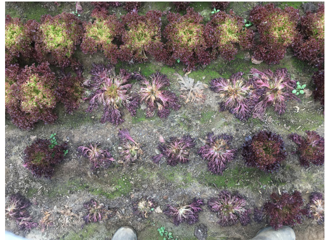
Bottom rot in lettuce.

Bottom rot was reported last week in lettuce in several high tunnels across the region. Bottom rot is caused by the fungus Rhizoctonia solani , which can also cause damping off in seedlings, wirestem in brassicas, and other seedling diseases. Rhizoctonia solani is present in most soils, but it is not a strong pathogen so it only causes disease when plants are somehow weakened, like in the cold, dark winter when lettuce crops are growing slowly. Rhizoctonia survives in the soil, as mycelium or sclerotia, and infects lettuce leaves that are in contact with the ground. Infected leaves turn brown and then melt. Bottom rot is most commonly seen affecting older lettuce plants. Measures that can help prevent bottom rot include tilling under summer crop residues well, using raised beds with good drainage, and taking measures to reduce leaf wetness (ventilate the tunnel when it's warm enough to do so, use drip irrigation instead of overhead, avoid using row cover unless needed to prevent frost damage, control weeds). Few fungicides are labeled for bottom rot and there is little efficacy on their performance. For a list of labeled products, see the lettuce disease section of the New England Vegetable Management Guide .