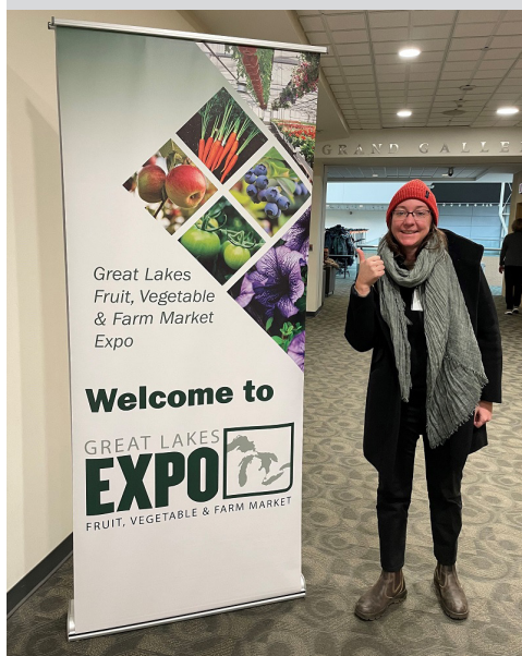
We were excited to attend this year's Great Lakes Expo this month! Hoping to see many of you at upcoming events this winter!

With our last Veg Notes issue of 2023, we want to thank you for reading, even if you never make it past Crop Conditions and Pest Alerts during your busy days in the field! Our goal is to provide vegetable growers with timely, science-based information, and we hope we've met that goal this year. Much of our work within the Vegetable Program is grant-funded, which means we have funding to do specific research and educational activities, but the production of Veg Notes does not receive any grant support. If you'd like to support 2024 Veg Notes production, we greatly appreciate any and all donations! Click the button below to make a donation by check or card.