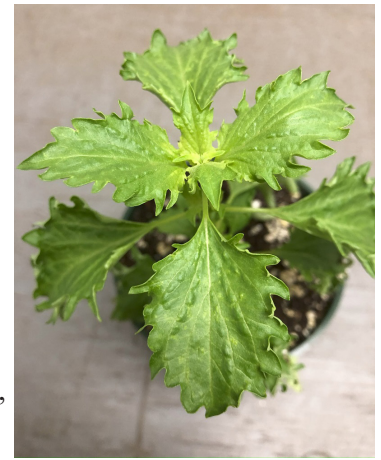
‘Mrihani’ basil, the BDM-resistant parent of the Rutgers resistant varieties.

Genesis Seeds’ Prospera® series originated from an interspecific hybrid cross between a sweet basil variety and a BDM-resistant wild American basil (a different species from sweet basil). Once the resistance was established by this cross, the breeders selected for growth habits and other desired characteristics, resulting in 5 Prospera® varieties – Cut Genovese (CG1), Italian Large-Leaf (ILL2), Potted Large-Leaf (PL4), Potted Small-Leaf (PS5), and Red. In comparison to the multi-gene resistance present in the Rutgers varieties, the resistance in the Prospera series is controlled by a single dominant resistance gene, but is susceptible to BDM race 1. However, Genesis recently announced the release of a new line called ‘Prospera Active’ with a second source of BDM resistance, giving it resistance to race 1 isolates.