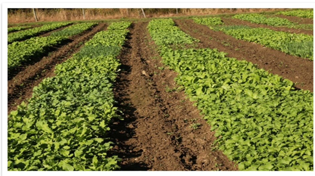
Brassica Species Trail

These innovative strategies will provide opportunities for animal operations to diversify their forage production on their farm with reliable cropping options to increase the resiliency of their farm businesses and thus increase the food security and environmental adaptability of our region.