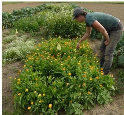
Sue counting syrphid flies in her insectary study for managing cabbage aphids in Brussels Sprouts.