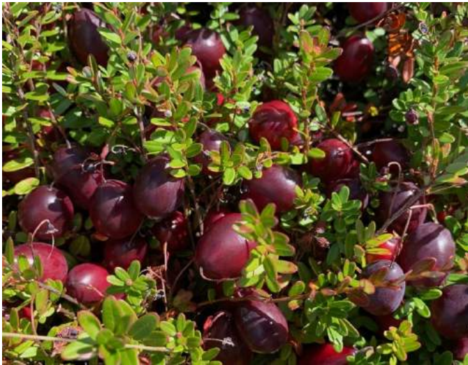
Early Black 24°F Dark Red Fruit Stage