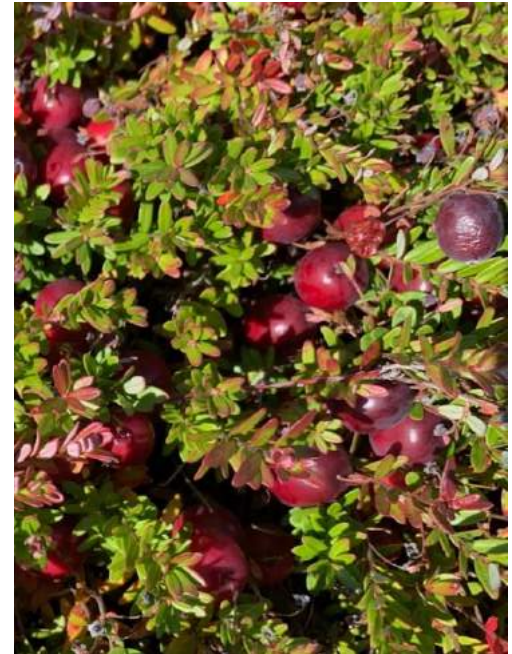
Demoranville 24°F Deep Red Stage