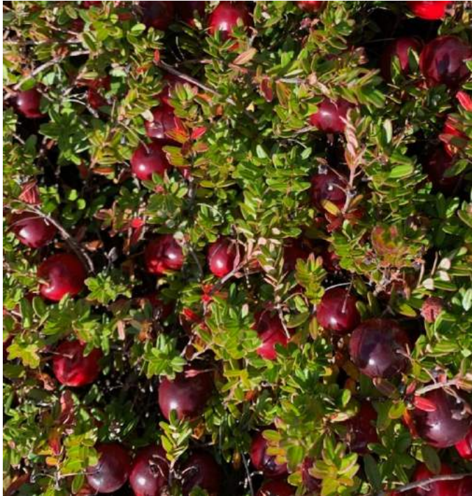
Crimson Queen 24°F Deep Red Fruit Stage