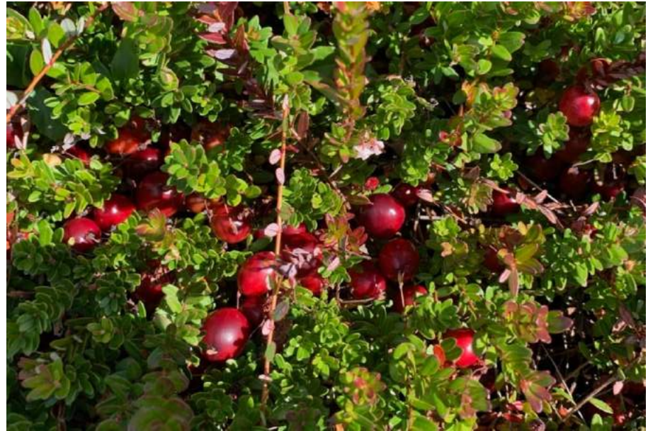
Stevens 25°F Red Fruit Stage