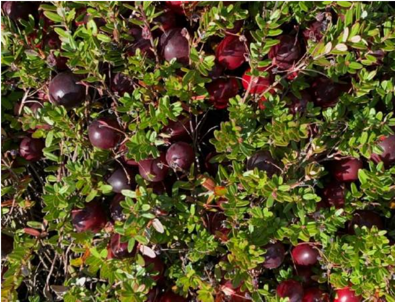
Ben Lear 24°F Deep Red Fruit Stage