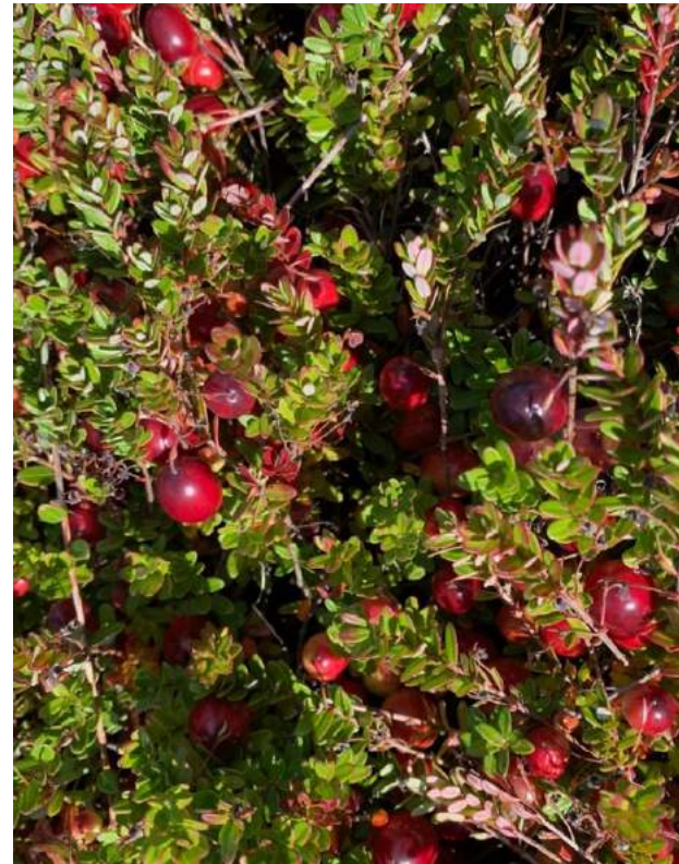
Howes 25°F Red Fruit Stage