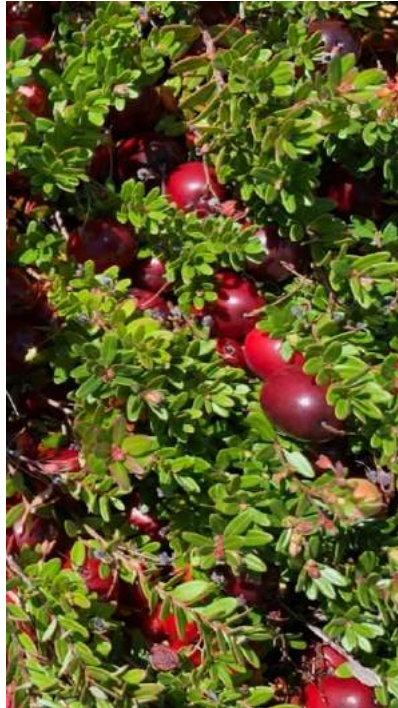
Mullica Queen 25°F Red Fruit Stage