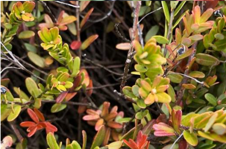
Early Black, Rosebrook 4.13.21 White bud stage, tolerance 20°F