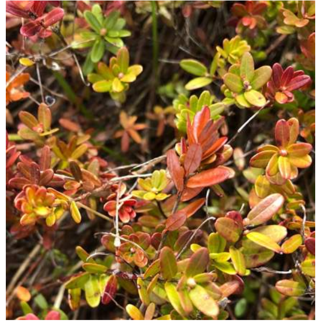
Ben Lear, Rosebrook 4.13.21 White bud stage, tolerance 22°F