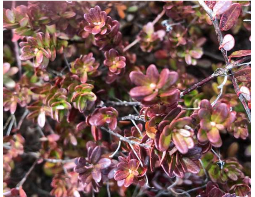
Howes, Rosebrook 4.13.21 White bud stage, tolerance 20°F