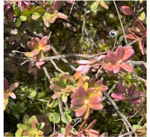
Stevens, Rosebrook 4.13.21 White bud stage, tolerance 22°F