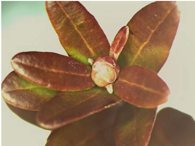
Crimson Queen 22°F