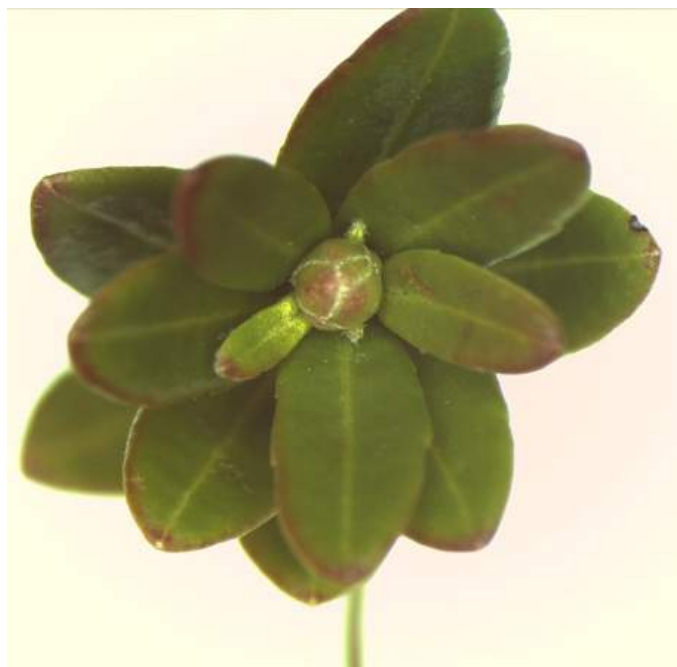
Early Black 20° F