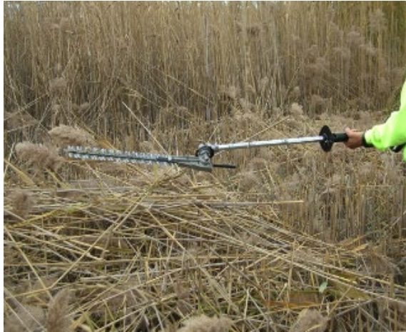
Phragmites being mowed

If smaller plants are established and it is not possible to remove all the stems and roots by hand, targeted herbicide applications such as glyphosate wipes can be used to manage the weeds. Plants should be wiped as soon as possible, as some regrowth may occur and multiple applications may be needed. Delaying applications can give the fast-growing plant the opportunity to establish large root systems and may make eradication more difficult (Ghantous, pers. obs.). For large established stands, management methods include cutting, herbicide application, hydraulic controls, dredging, and summer/fall burning. Cutting, however, can be labor intensive (Somers et al., 2008). Combining herbicide