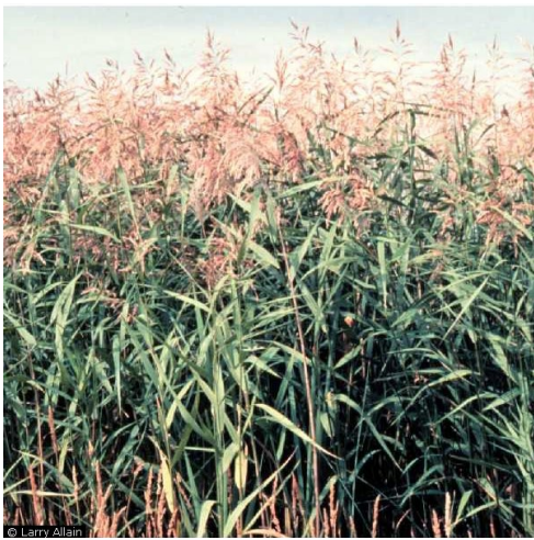
Phragmites australis by Larry Allain, from USDA- NRCS PLANTS database

Phragmites can be found in marshes and other natural wetlands as well in highway margins and pipeline corridors since it is able to tolerate salty and alkaline conditions. It favors wet open locations with a soil pH of 5.5-8 and can grow in stagnant or flowing water. Phragmites devalues wetland habitats for wildlife by colonizing the habitat at the expense of other vegetation. (Uva et