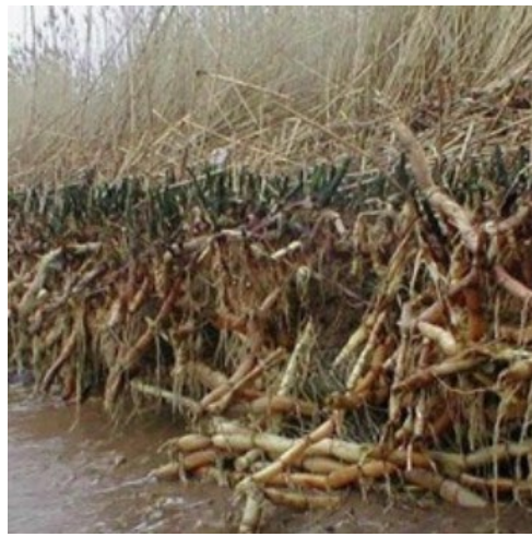
al., 1997; Sandler et al., 2015; Somers et al., 2008). Large rhizomes. Great Lakes Phragmites Collection