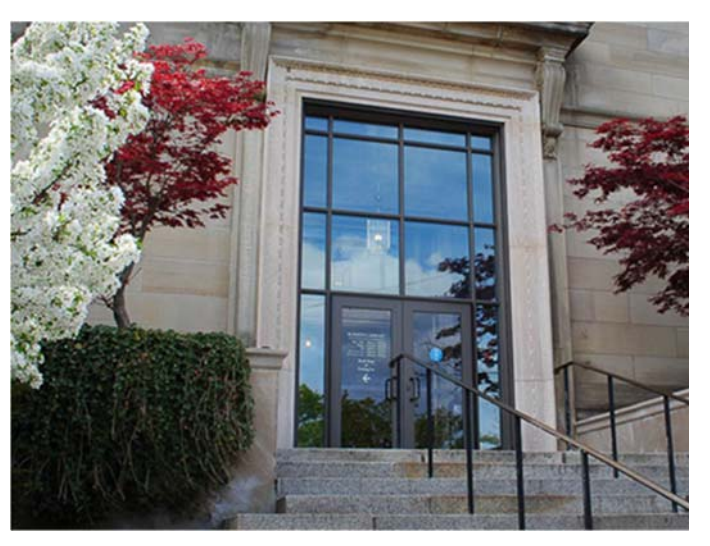
Energy use has been reduced by nearly 40% in Arlington's library

Massachusetts Department of Energy Resources | Creating A Clean, Affordable, Resilient Energy Future For the Commonwealth 100 Cambridge Street, Suite 1020 | Boston, MA 02114 | (617) 626-7300 | www.mass.gov/energy/greencommunities